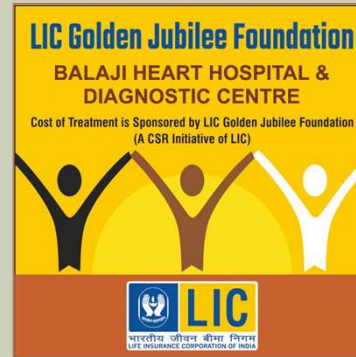
LIC GOLDEN JUBILEE FOUNDATION