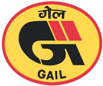
GAIL (INDIA) LTD