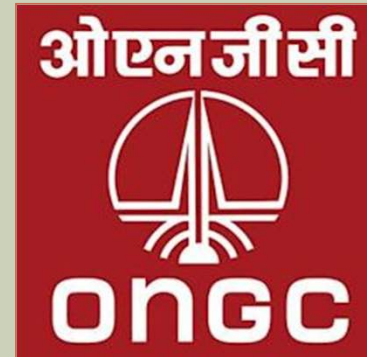
OIL AND NATURAL GAS CORPORATION