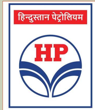
HINDUSTAN PETROLEUM CORPORATION LIMITED